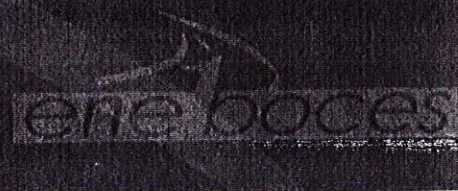
EXHIBIT D (CONTINUED)