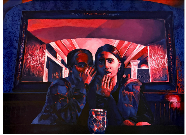
Spencer Sweet, The Burden of Persuasion, Acrylic