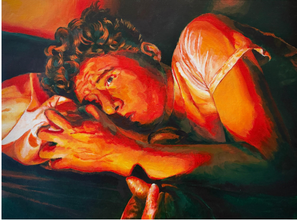
Spencer Sweet, Toss and Turn, Acrylic