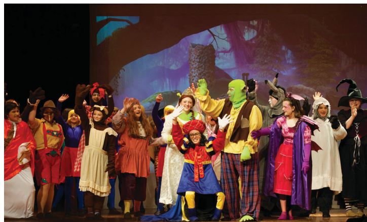
▲ St. Patrick's Day STEM activities at Poestenkill Elementary.