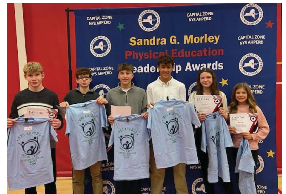
▲ AMS students were honored with the Sandra G. Morley Physical Education Leadership Award, presented by the New York State Association for Health, Physical Education, Recreation and Dance.