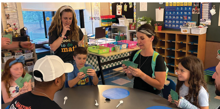
▲ Students and families took part in Math Night at Miller Hill Elementary.