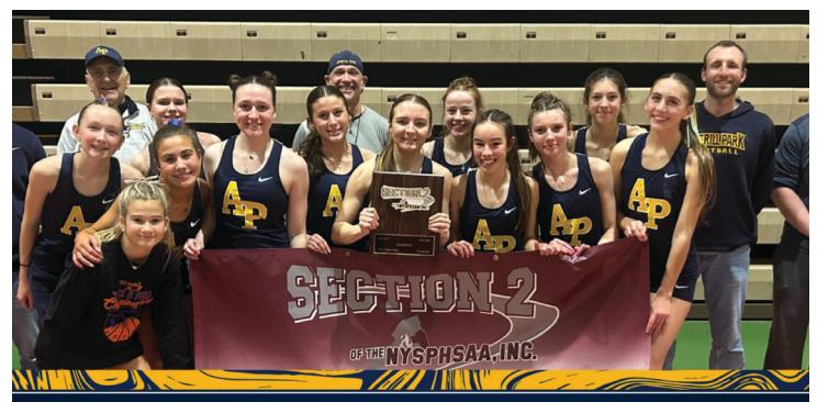
▲ Girls indoor track & field captured the first Section 2 championship in AP history.