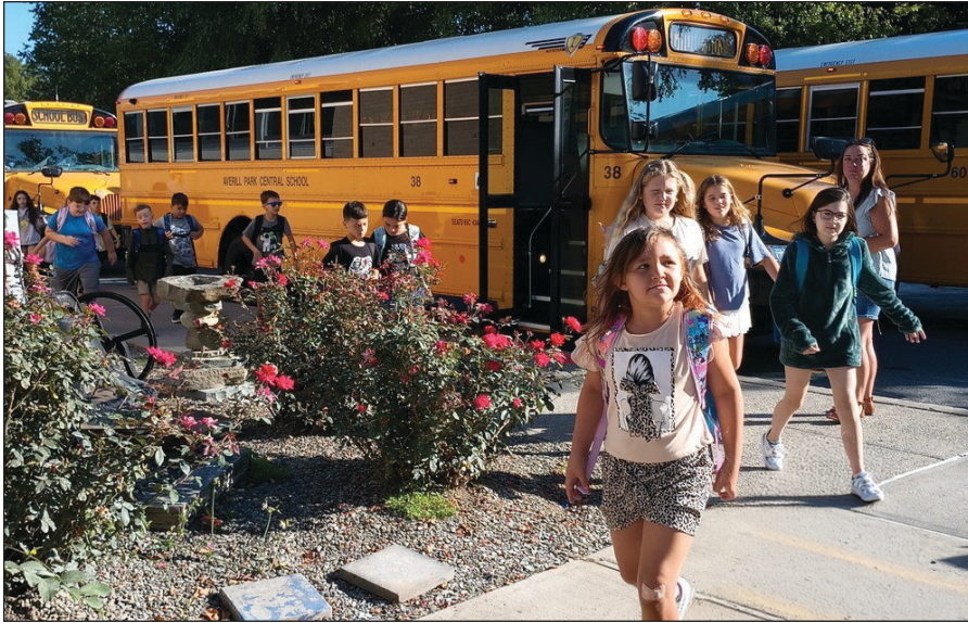
Students arriving by bus on their first day of school.